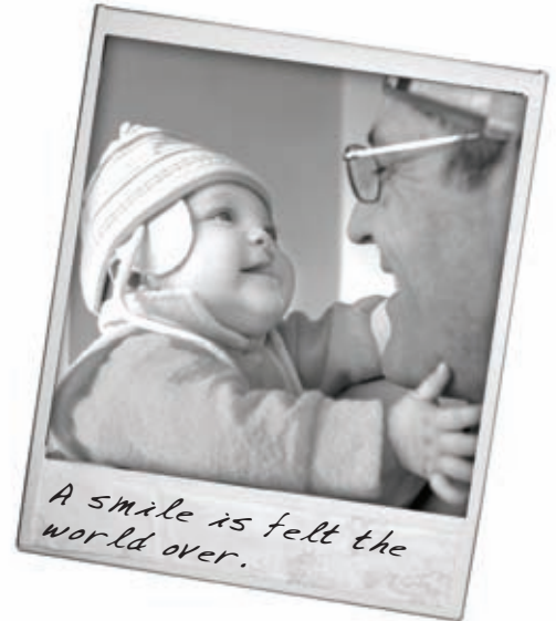
A smile is felt the world over.

Operation Smile now has a presence in 51 countries, and Operation Smile volunteers have treated more than 130,000 children worldwide.